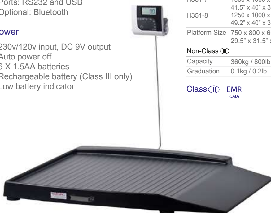
H351-7 with one wide ramp