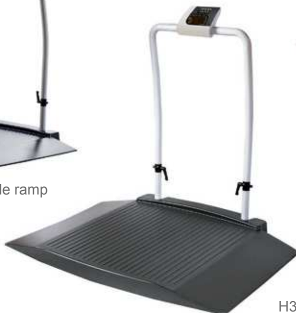
H351-3 with two wide ramps