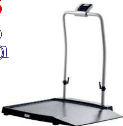
H351-2 with one wide ramp