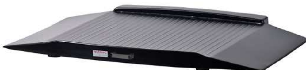
H351-8 with two wide ramps